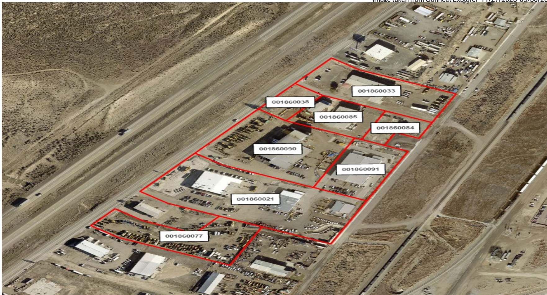
Image taken from Connect Explorer 11/27/2023-05/30/2024

BU002495 EMPIRE SOUTHWEST LLC CASE NO. 25-126 FISCAL YR 2024-25 EXHIBIT L-1